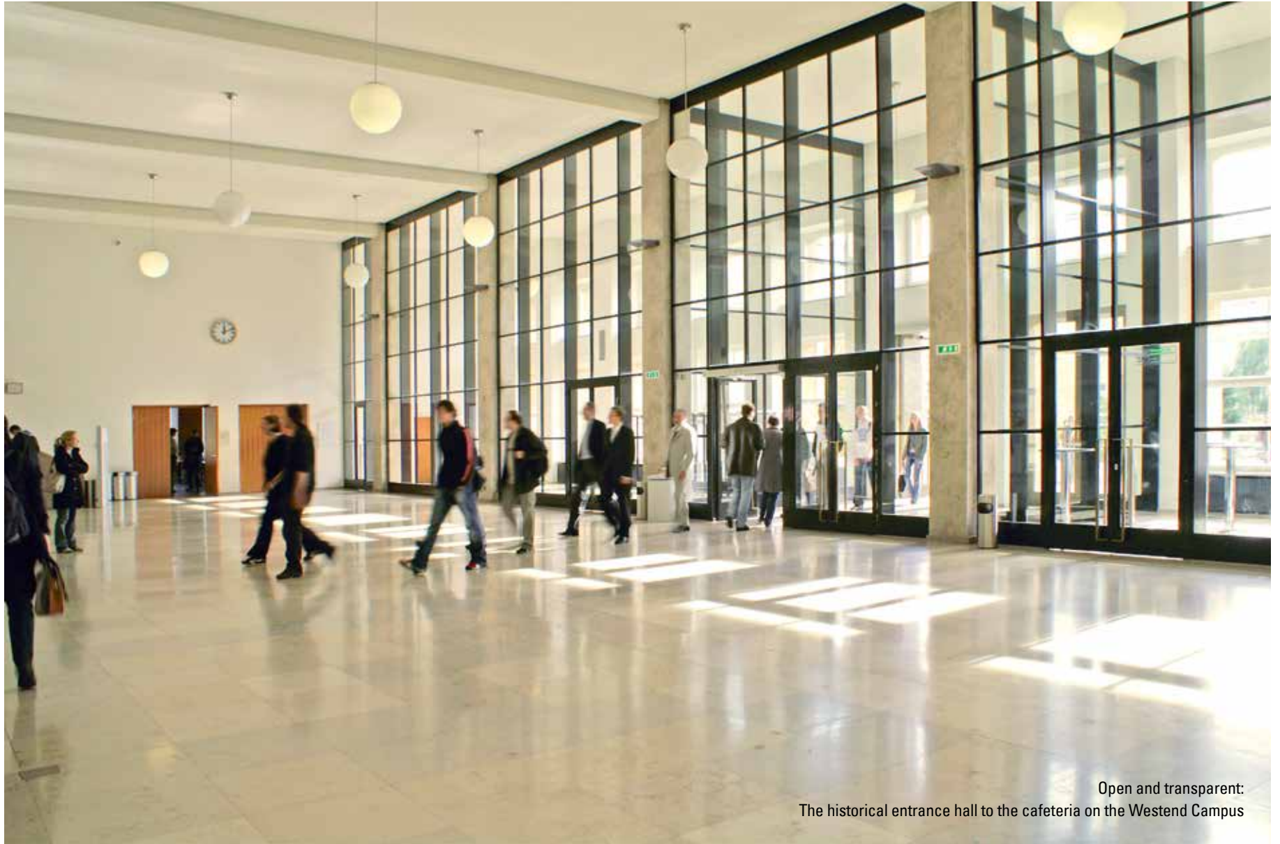
Open and transparent: The historical entrance hall to the cafeteria on the Westend Campus