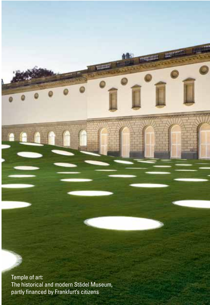
Temple of art: The historical and modern Städel Museum, partly financed by Frankfurt's citizens