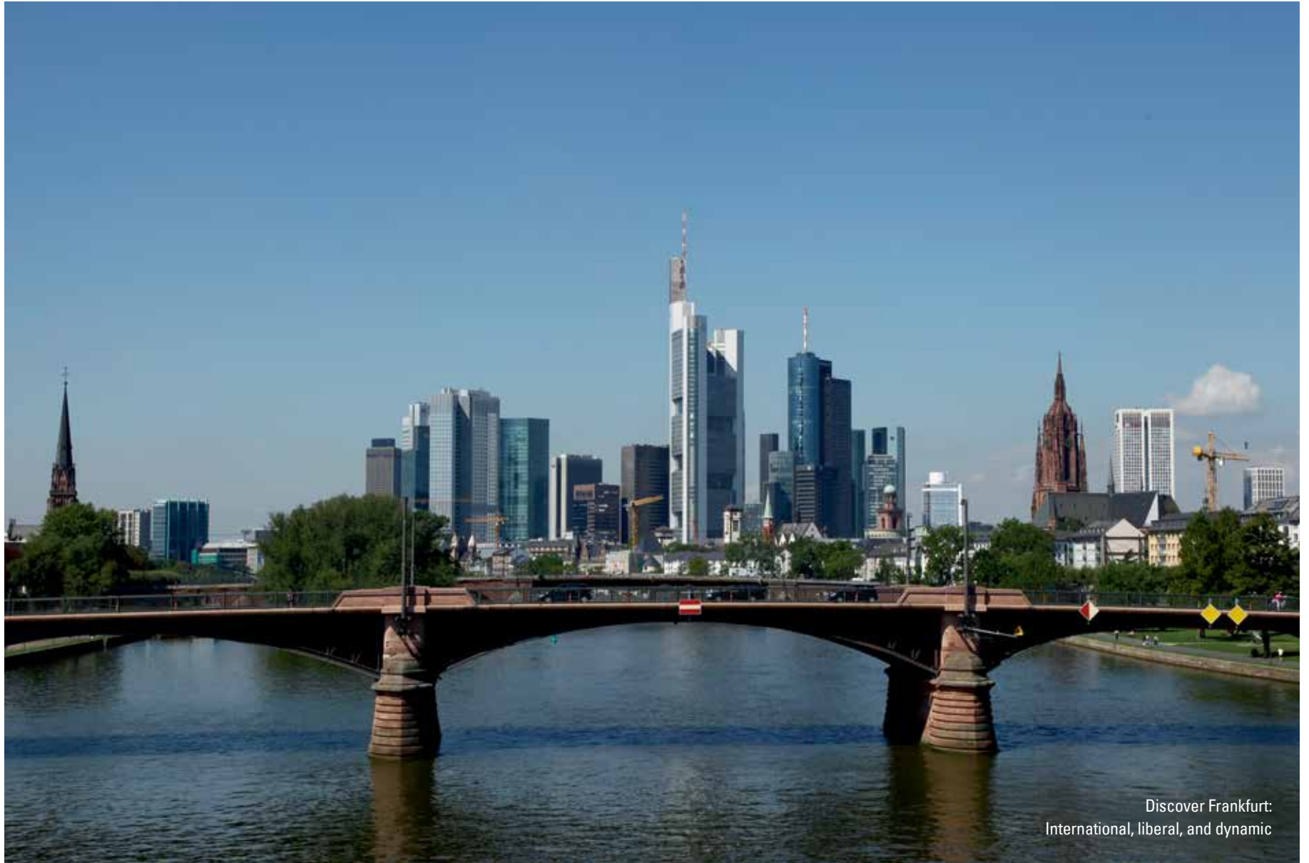
Discover Frankfurt: International, liberal, and dynamic