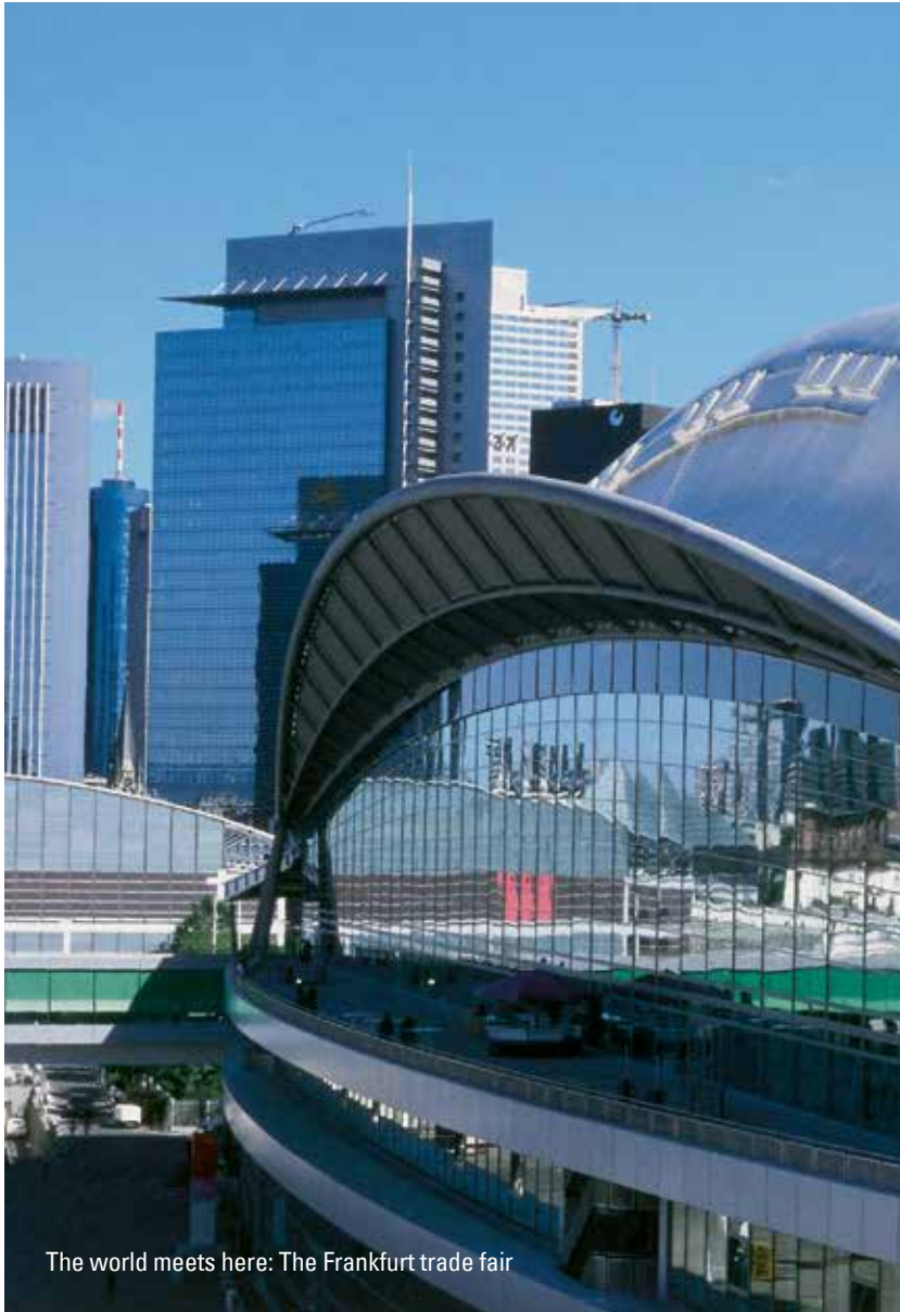
The world meets here: The Frankfurt trade fair

Businesses and entrepreneurs appreciate the various facets of the city: its internationally connected networks , an inspiring working climate, the excellent and reliable infrastructure it offers, a tightly interwoven academic landscape, a safe urban environment and last, but not least, Frankfurt's high standard of living. Some 20 years ago, a career move from London or Paris might have been regarded as problematic, but nowadays the city has significantly increased its appeal, with its highly professional environment, its historic and modern architecture, a rich cultural life and above all, its humanity: all values that have gained in importance when it comes to recruiting top personnel.