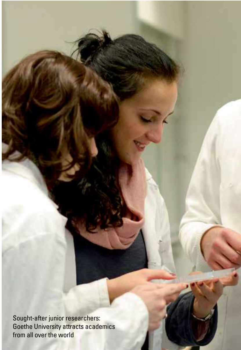
Sought-after junior researchers: Goethe University attracts academics from all over the world