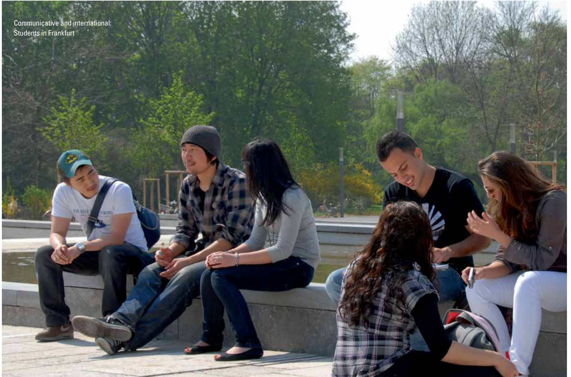
Communicative and international: Students in Frankfurt